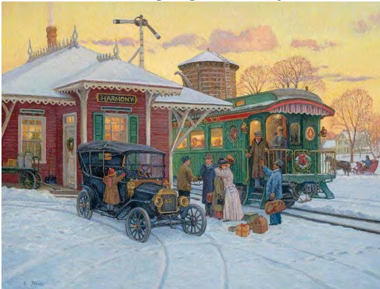
"All Aboard for the Ridge"

The Ridge management has waived our usual room rental fee because we were willing to change dining rooms. That's a plus for us and, personally, I think it will be fun to see all the additional Christmas festivities going on that day.