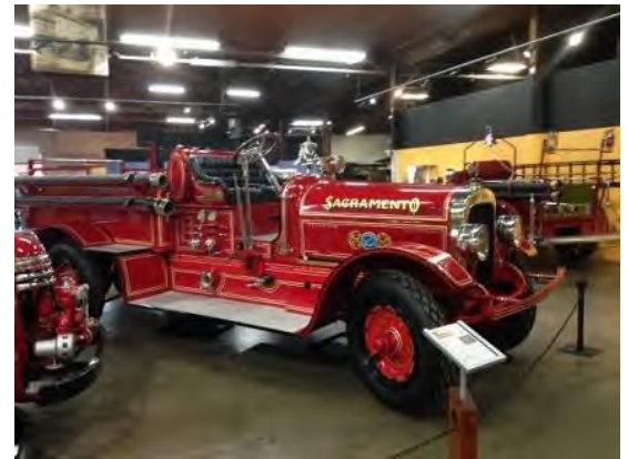
Vintage Fire Truck display at the CAM

http://raisetherooftcam.causevox.com/Raise the Roof