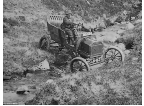
Taking a short cut to the Shake Down