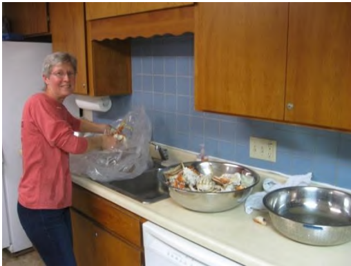
Kitty getting the crab ready