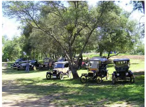
Iris farm Tour April 2005