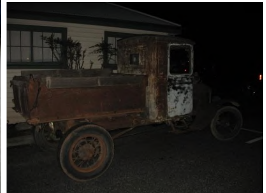
And of course, Erik's TT Dump to haul off the garbage