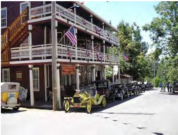
Dutch Flat - July 2004