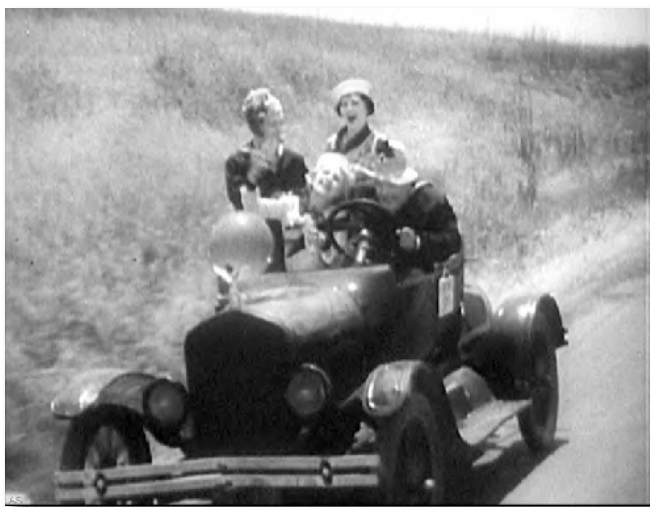
It's time to celebrate!!!!!!!!!!!!