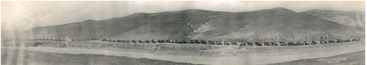
Ford Picnic, April, 1914, Haberfelde Ford, Bakersfield, California. (Editor's note: Bought a new Mustang there in 1969)