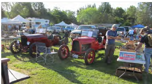
Treasures from last year’s Swap Meet