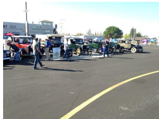
From the Auburn Air Show, September 27