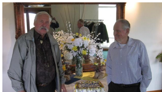
Solving the world's problems