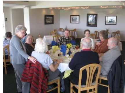
Just a Lot of Socializing