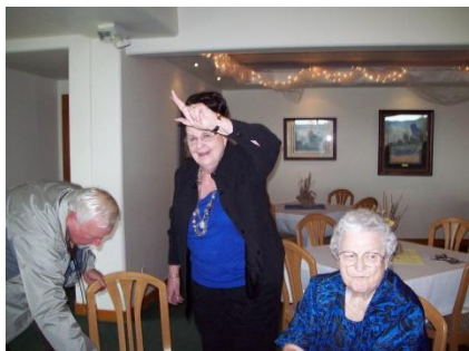
Looking for the Gold Sticker