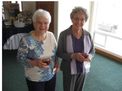
The Welcoming Duo