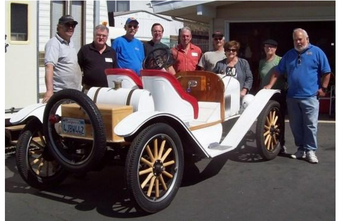
Allen's Speedster, ready to drive home safely!