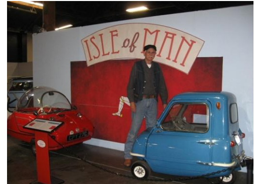
A Peel P50, currently holding the record for the smallest automobile to go into production.

WIKIPEDIA - In the UK: "economy vehicles with either three or four wheels, powered by petrol engines of no more than 700cc or battery electric propulsion, and manufactured since 1945" .