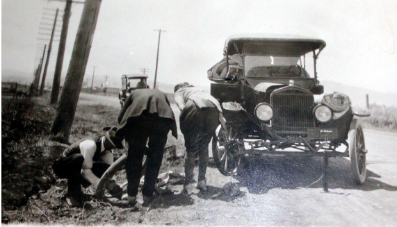
Nothing like fixing a flat in your Sunday best!