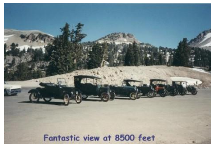
Lassen National Park