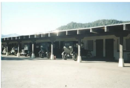
1920's Motel for 1920's cars