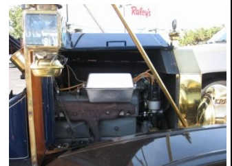
Homemade from bread pans