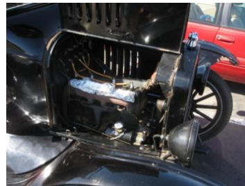
Directly on the manifold

Meet at Raley's 9 am, leave by 9:30. We will be touring to the Placerville area and the Gold Bug Mine Park. This year we are entertaining the idea of a Chili Cook off. This is the time to be creative. The chili is optional. We will be eating picnic style in a covered area with tables and benches. Cook you main course on the manifold or bring something already prepared. Then bring a potluck side dish to share, salad, snack item or dessert. So, let's see what we can cook up on the manifolds and exhaust pipes. We will sample the chili's and see who has the best. There is an optional mine tour available also.