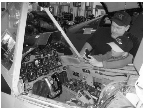
Kenny & Levi check out the controls