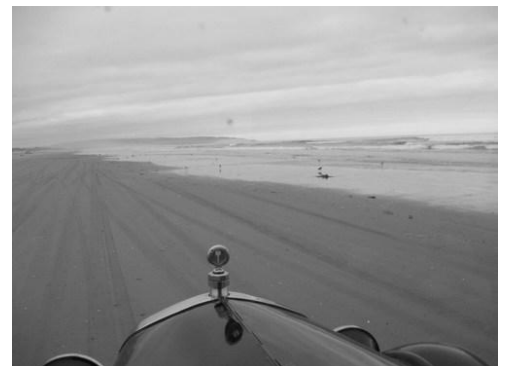
Driving on the beach at Oceano