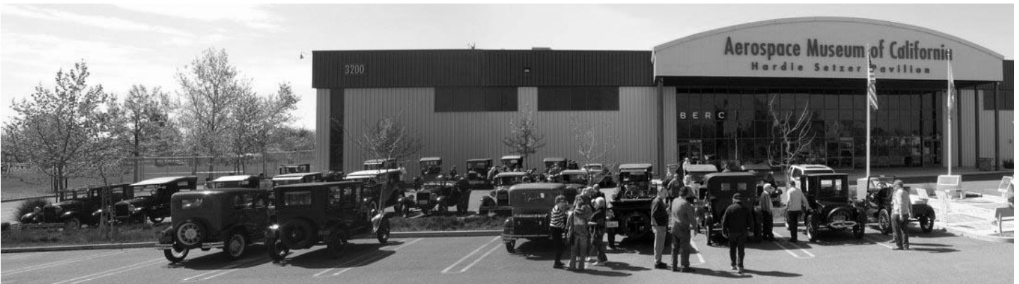
Shake Down - At the Aero Space Museum