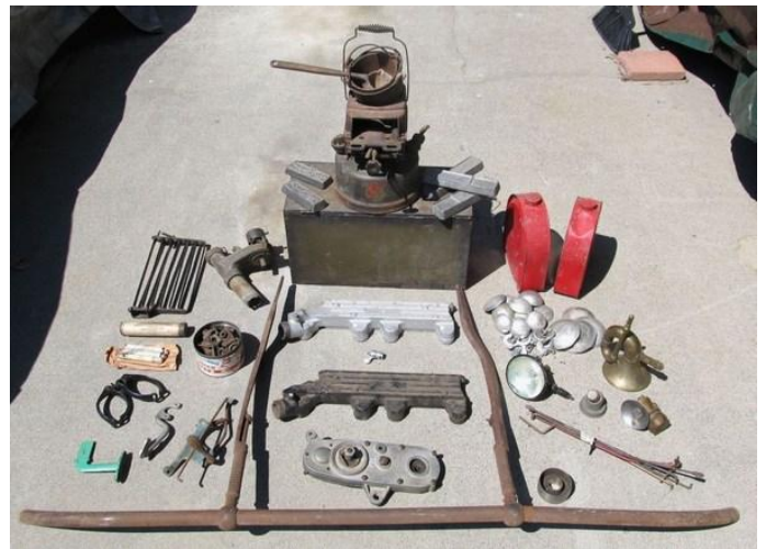
Some of the Goodies found at the meet