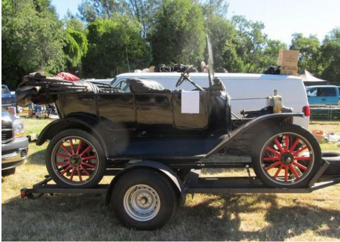
Nice '15 that sold