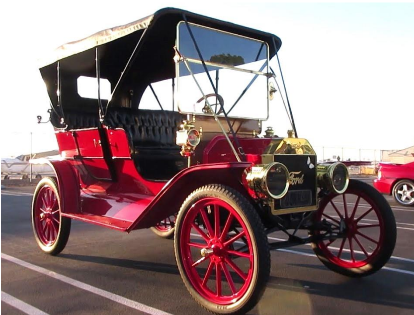
1909 Model T