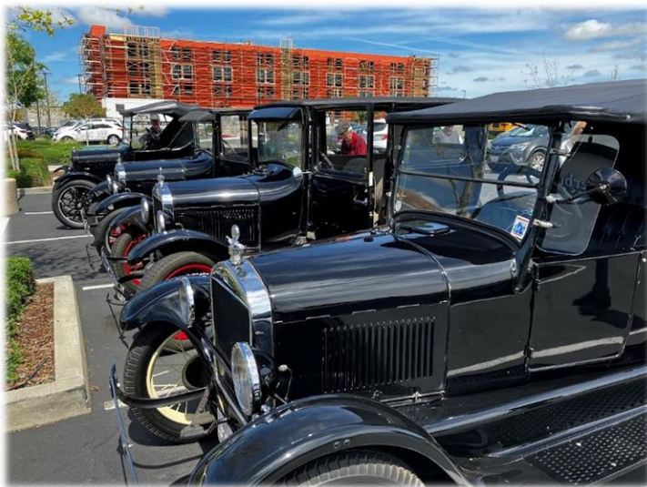
Memories - Shake Down 2024