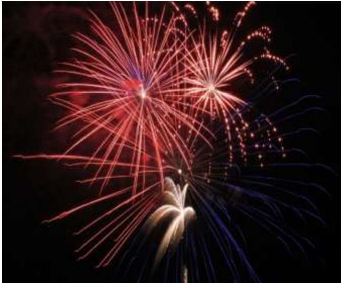
Time to Celebrate with a Bang!

Black Bear Diner, 13365 Lincoln Way Auburn, CA, ( Across the street from McDonalds ) Dinner 5:30, Meeting starts 6:30. Prospective members welcome. Bring a Show and Tell